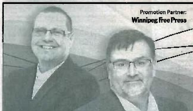
Promotion Partner: Winnipeg Free Press