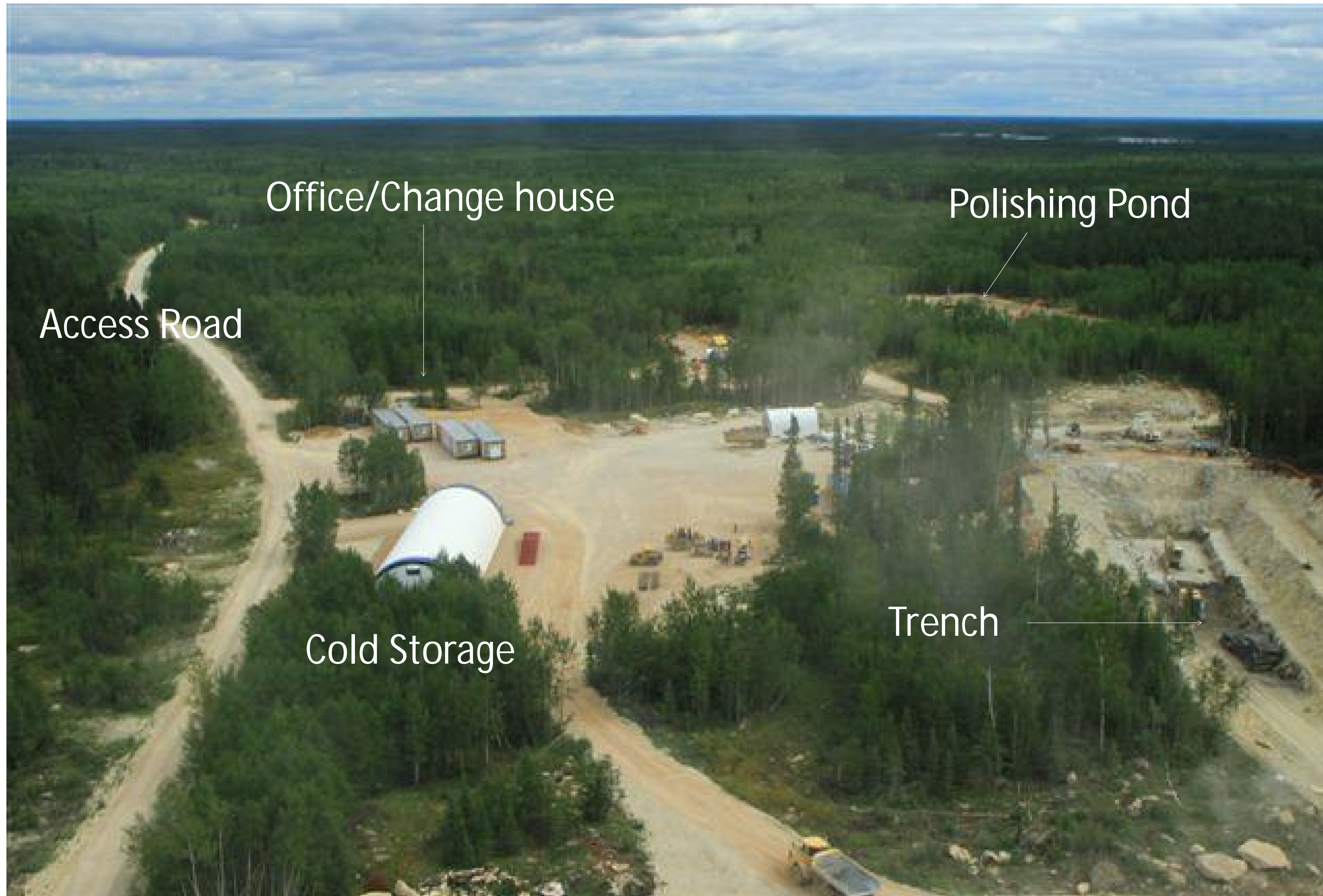
Reed AEP Site, Looking East (2012)