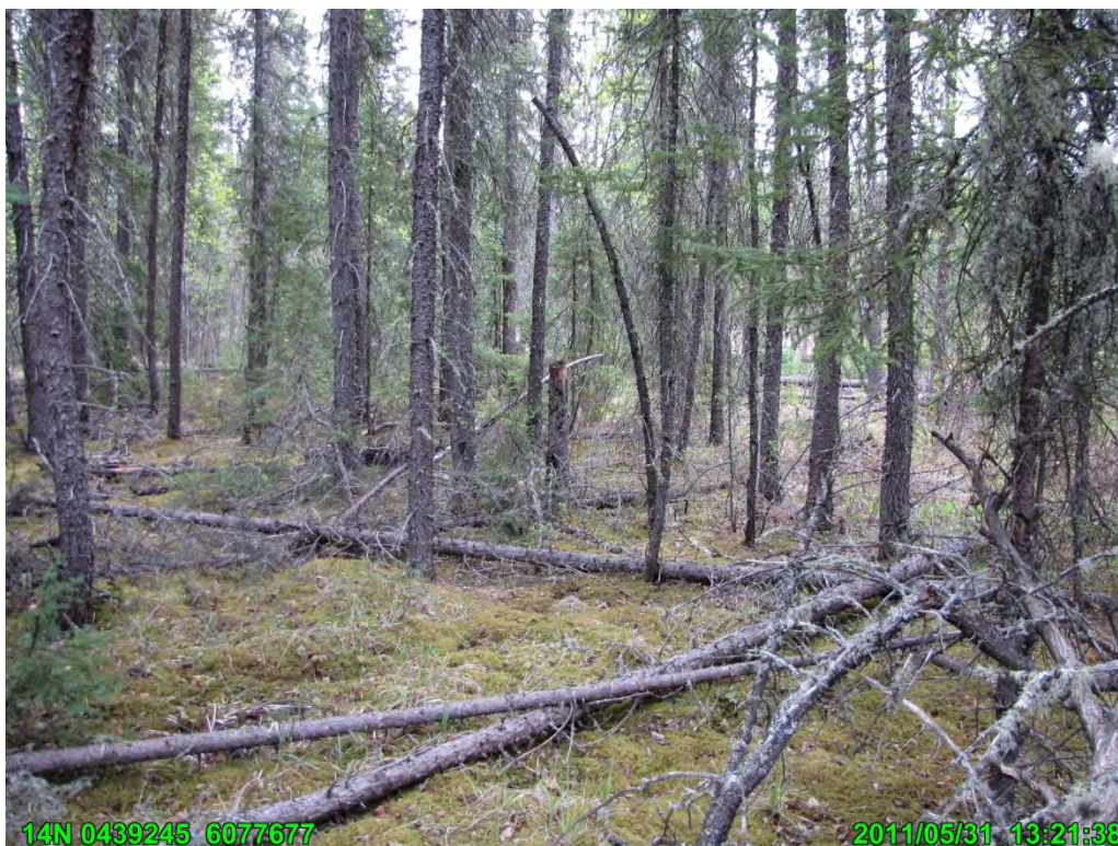
Photograph 44. Black Spruce stand on the north side of Anderson Creek. (31 May 2011)