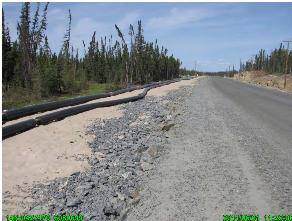
Photograph 38. Water pipelines adjacent to Lalor Access Road. (1 June 2011)