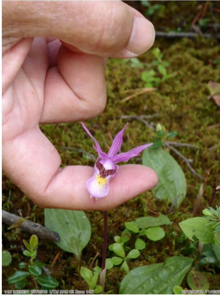
Photograph 47. Fairy Slipper Orchid Observed along PR 395, south of the Lalor Access Road ( Calypso bulbosa ). (12 June 2012)