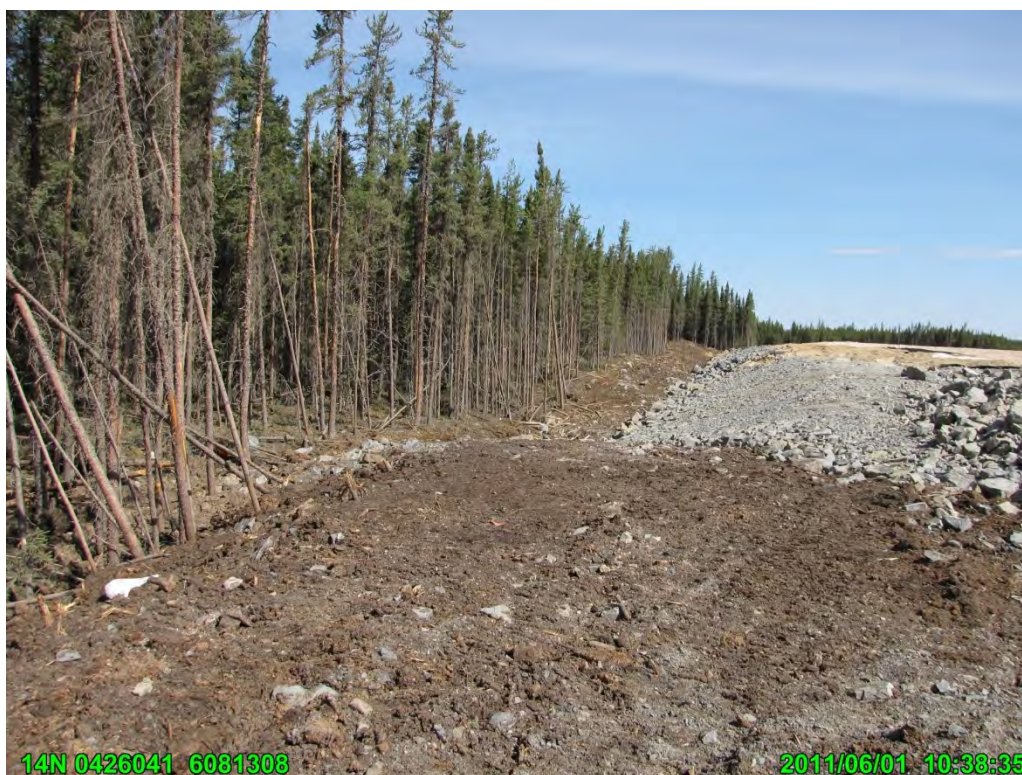
Photograph 34. Margin of the rock outcrop and the Lalor site. (1 June 2011)