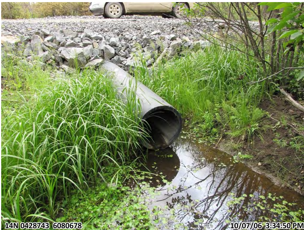
Photograph 30. Vegetation downstream of culvert crossing 1 (Lalor Access Road) (6 July 2010)