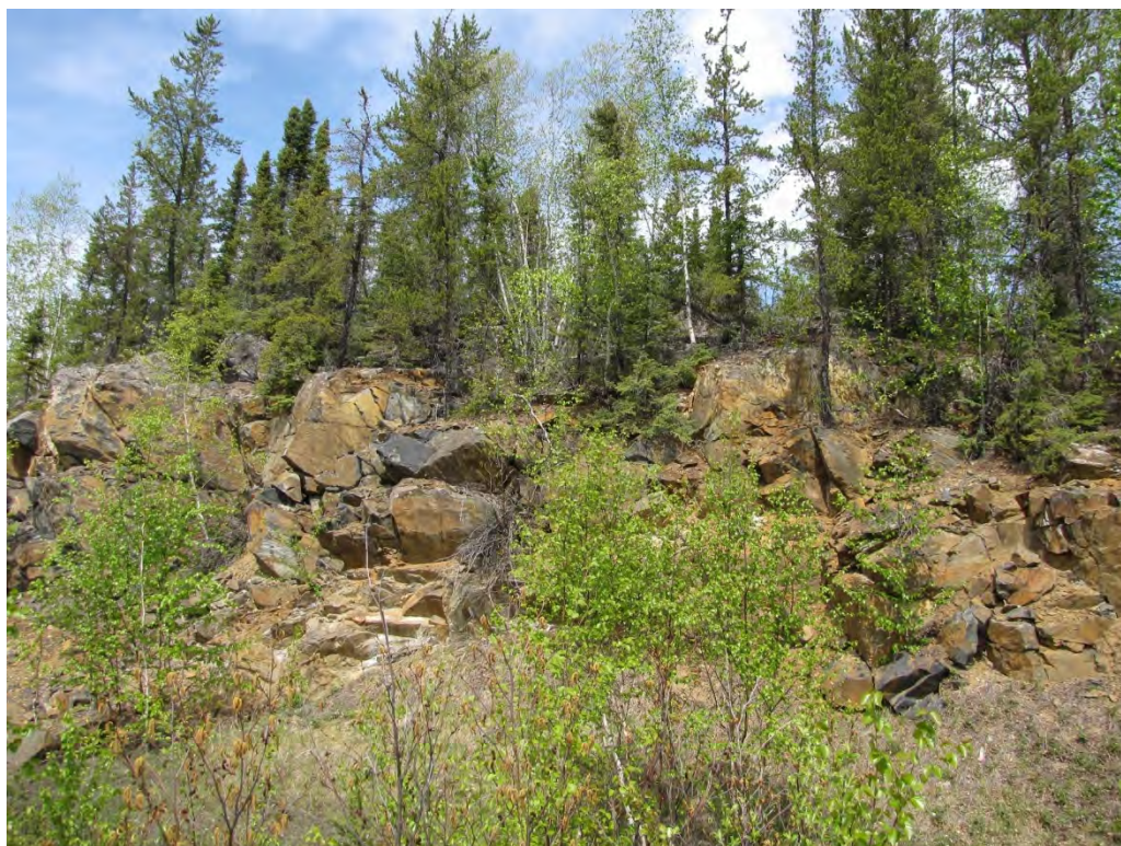
Photograph 40. Rock cuts along the former rail bed. (1 June 2011)