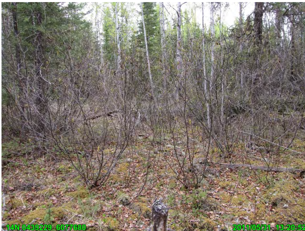
Photograph 45. Deciduous inclusions on the north side of Anderson Creek. (31 May 2011)