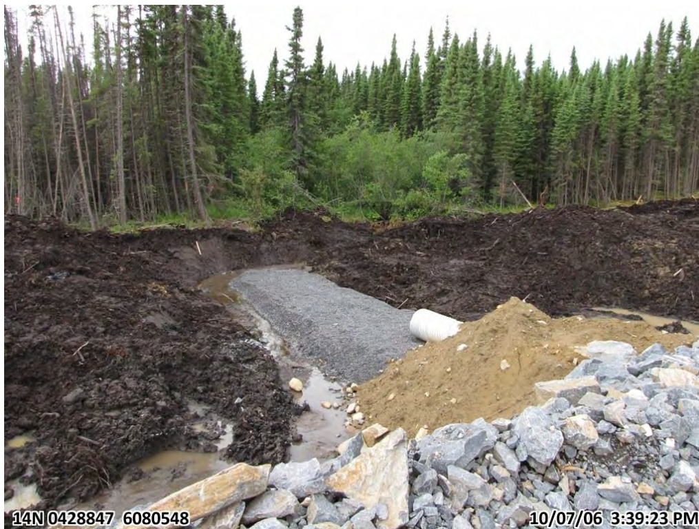
Photograph 31. Culvert crossing 1 (Lalor Access Road) (6 July 2010)