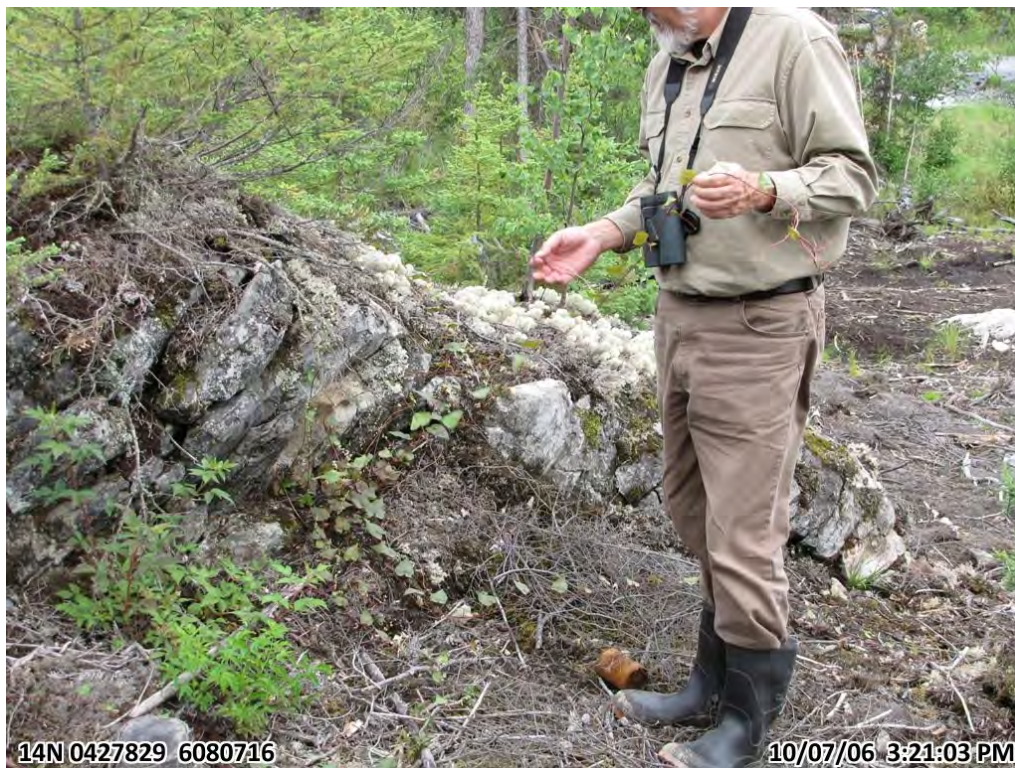
Photograph 27. Disturbed area to north of Lalor Access Road alignment (6 July 2010)