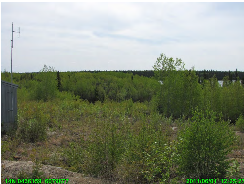
Photograph 41. Former Anderson Mine site with Anderson TIA in background. (1 June 2011)