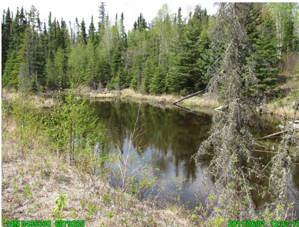
Photograph 42. Beaver pond adjacent to former rail bed. (1 June 2011)