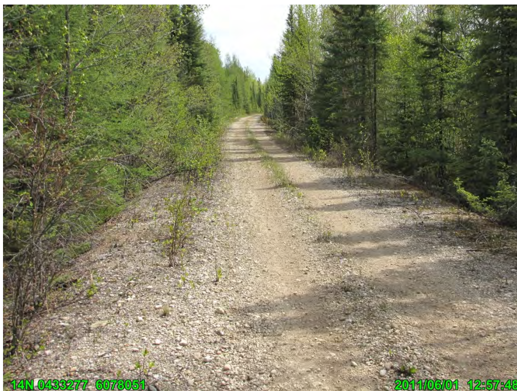
Photograph 39. General area of former rail bed. (1 June 2011)