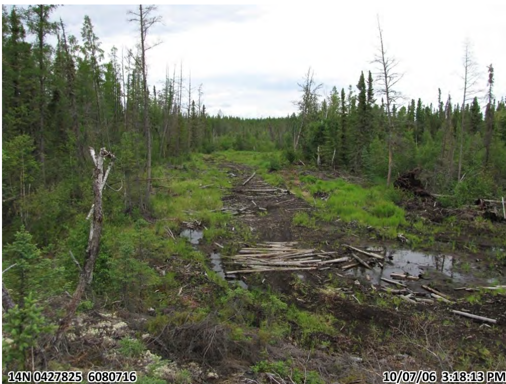
Photograph 26. Drill road to north of cleared alignment (6 July 2010)