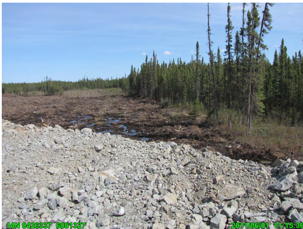
Photograph 33. Lalor site in wet bog off the rock outcrop. (1 June 2011)