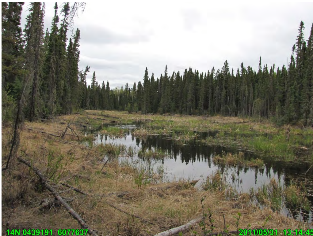
Photograph 43. Beaver pond just east of the existing PR 392 crossing. (31 May 2011)