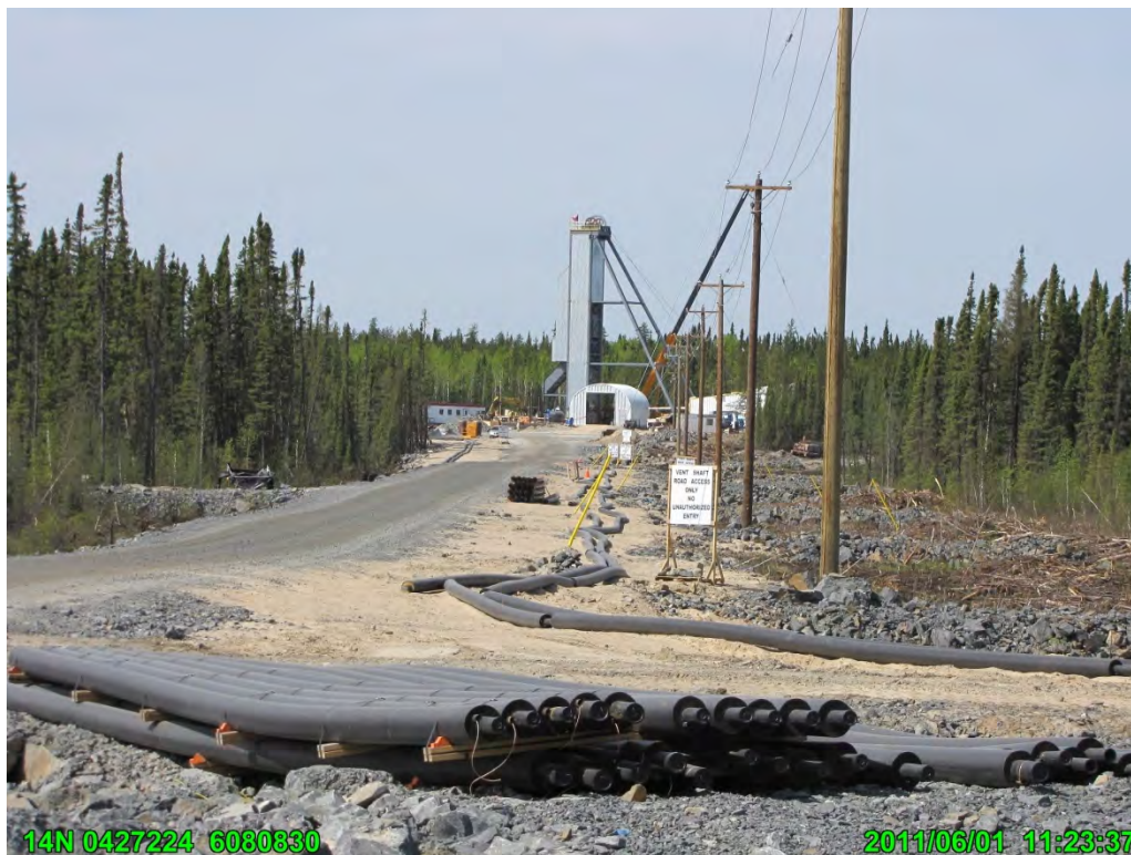
Photograph 37. Vent shaft and Lalor Access Road. (1 June 2011)