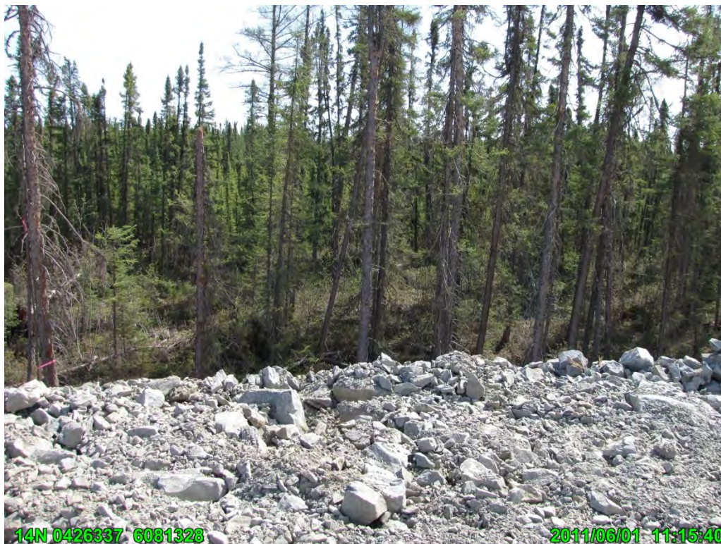
Photograph 35. Dense Black Spruce bog surrounding the Lalor site. (1 June 2011)