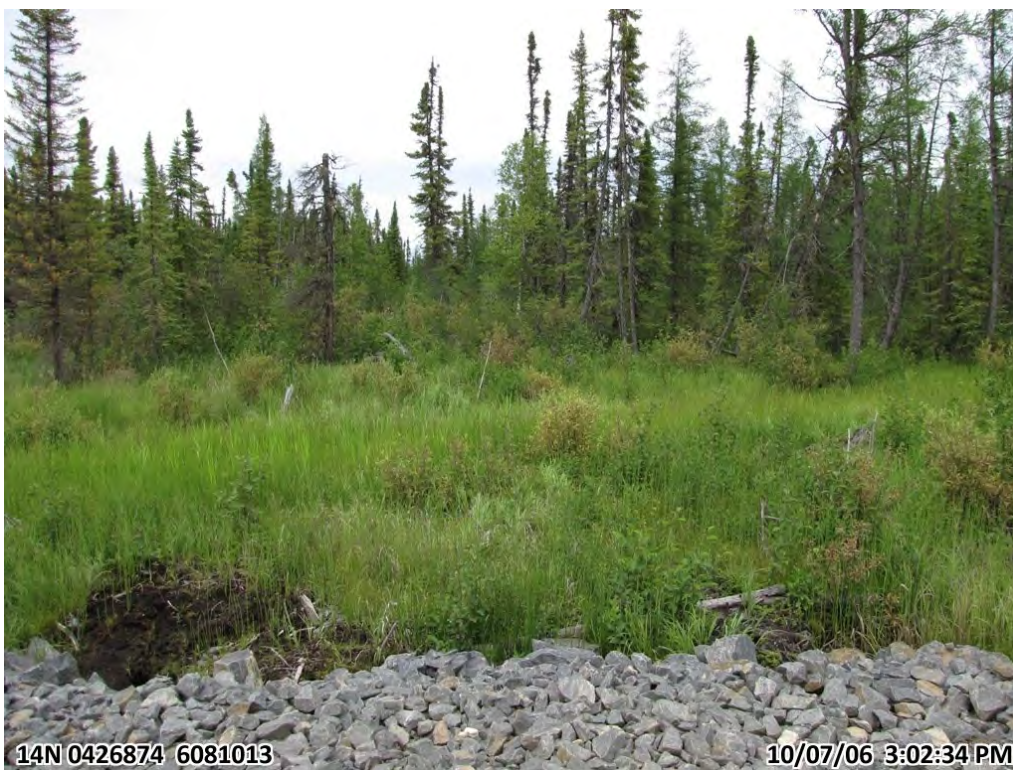
Photograph 25. Vegetation along disturbed area of Lalor Access Road (6 July 2010)