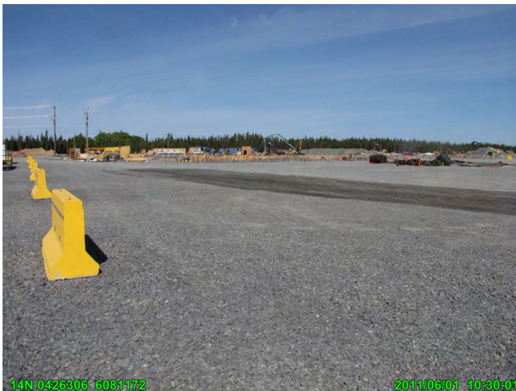
Photograph 32. The Lalor site (1 June 2011)