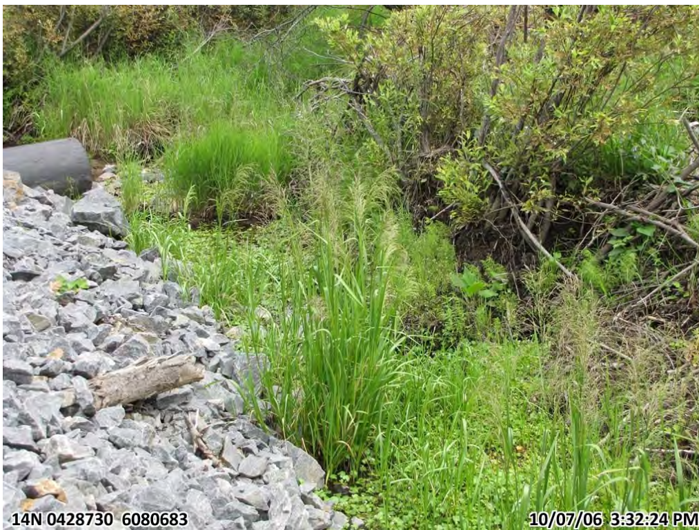
Photograph 29. Vegetation upstream of culvert crossing 1 (Lalor Access Road) (6 July 2010)