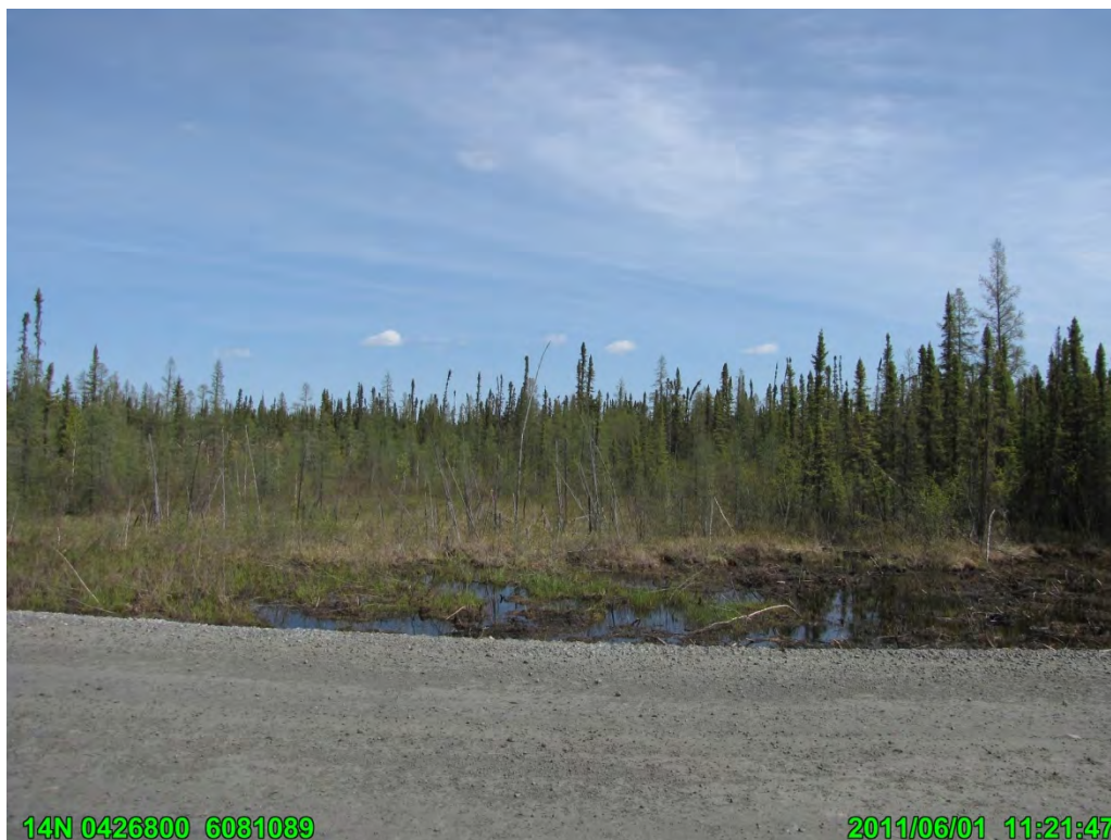
Photograph 36. Wet bog area adjoining the Lalor Access Road. (1 June 2011)