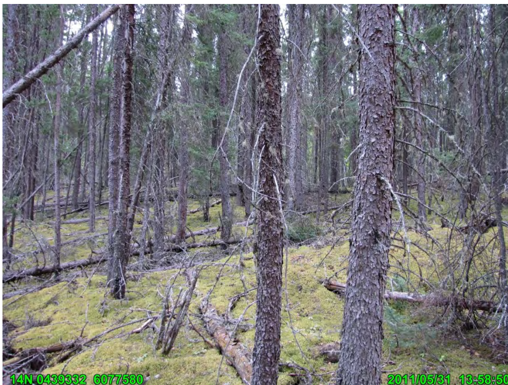
Photograph 46. Open Black Spruce stand on the south side of Anderson Creek. (31 May 2011)