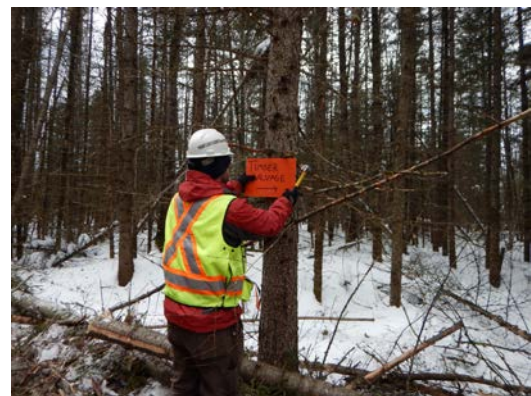
Photo 3: Timber salvage was conducted to provide fuelwood to neighbouring communities