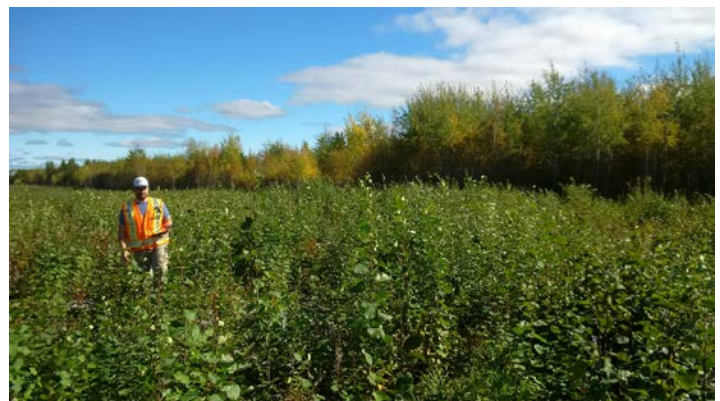
Photo 4: Environmental monitoring relied on right of way inspections, such as this mammal ground survey

All vegetation clearing required for project construction has now been completed. Environmental Inspectors are continuing to work with all contractors to maintain compliance with the environmental protection plan, including any construction works near stream crossings.