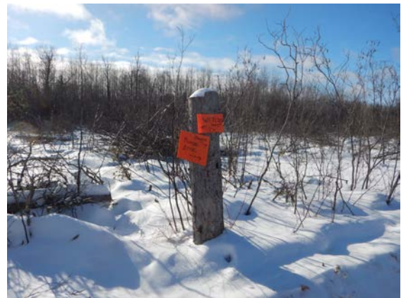
Photo 2: Environmental protection signage erected to help assist clearing crews

As the Project's EEMP requires and generates large amounts of data, the EPIMS was developed to manage, store and facilitate the transfer of Environmental Protection Program data and information amongst the Project team. The EPIMS will facilitate the transfer of knowledge and experiences encountered on a daily basis during construction activities from environmental inspectors and community environmental monitors to specialists that are responsible for monitoring project effects on a real time basis. As well, monitoring results and mitigation measure adaptations will be communicated back to construction staff and contractors.