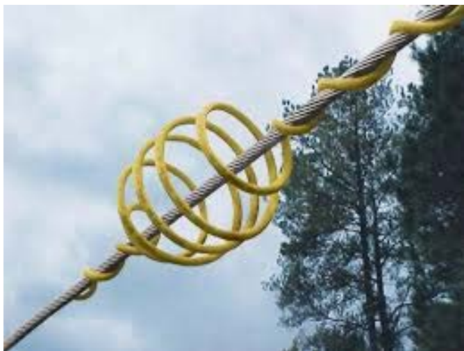
Photo 6: Bird diverters will help prevent bird strikes

The presence of transmission lines in proximity to areas of high bird activity may lead to bird – wire collisions. Manitoba Hydro has committed to installing bird diverters along transmission line sections that transect areas of high bird activity. Pre-construction surveys identified sensitive sites for birds, which were used to select locations for bird diverters. Bird-wire collision monitoring will initiate in 2017, after the transmission lines and bird deterrents are installed.