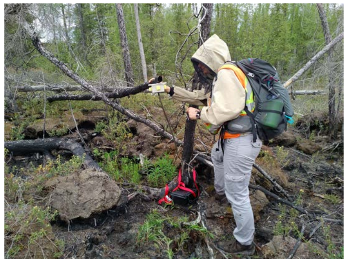
Photo 8: Installation of passive audio recorders to monitor for bird species of conservation concern