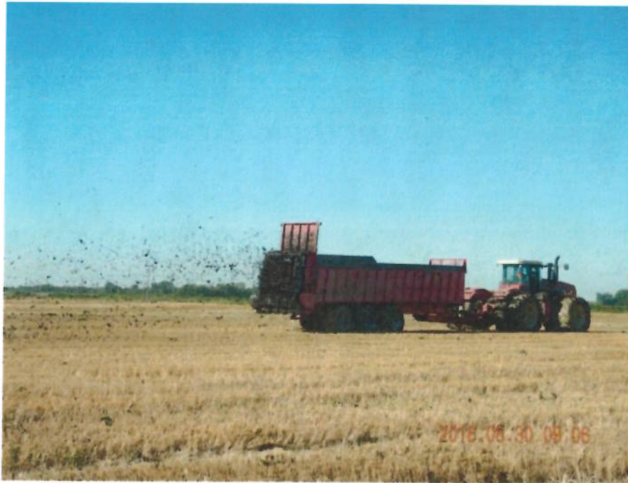
Photo 1. Land spreading biosolid material