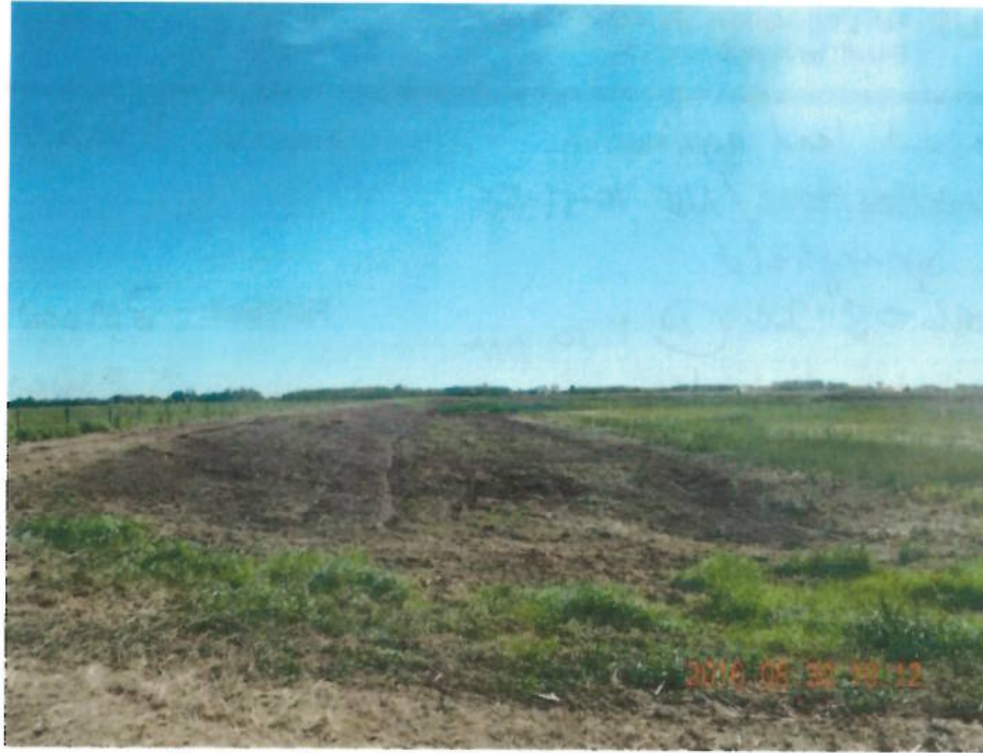
Photo 5. Completed North Cell at Dugald lagoon