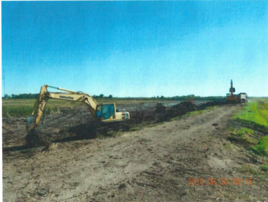
Photo 3. Removal process of biosolids from Cell #4 at Oakbank lagoon