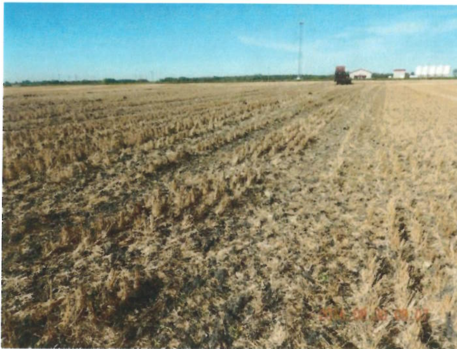
Photo 2. Post-spreading, first pass of material