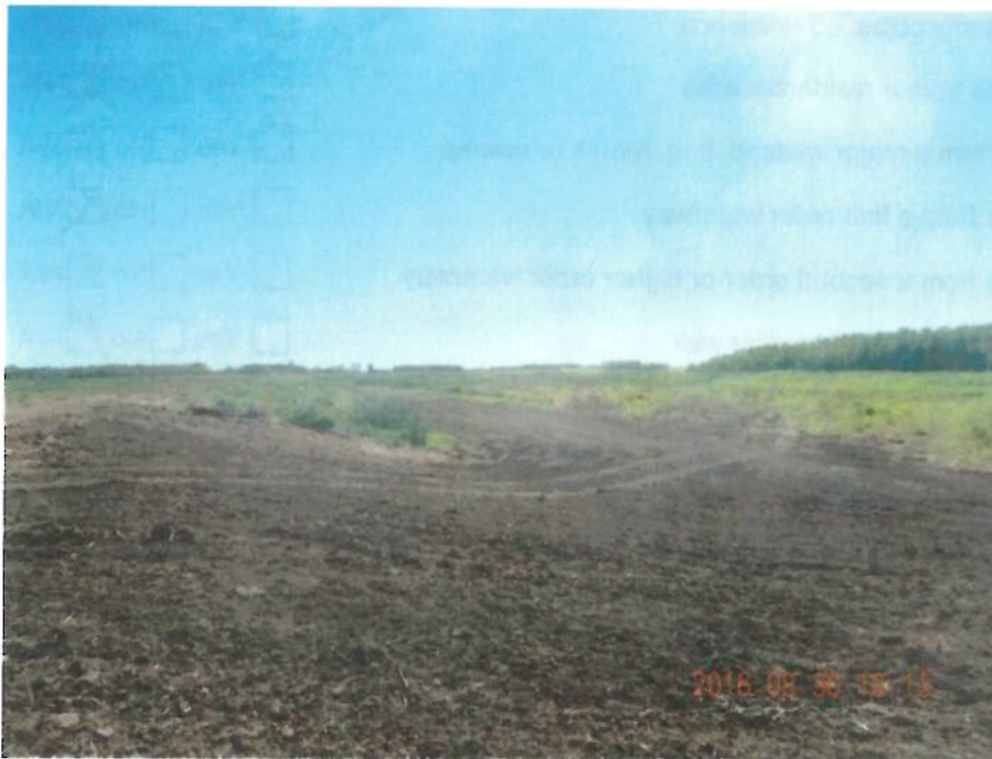
Photo 6. Completed South Cell at Dugald lagoon