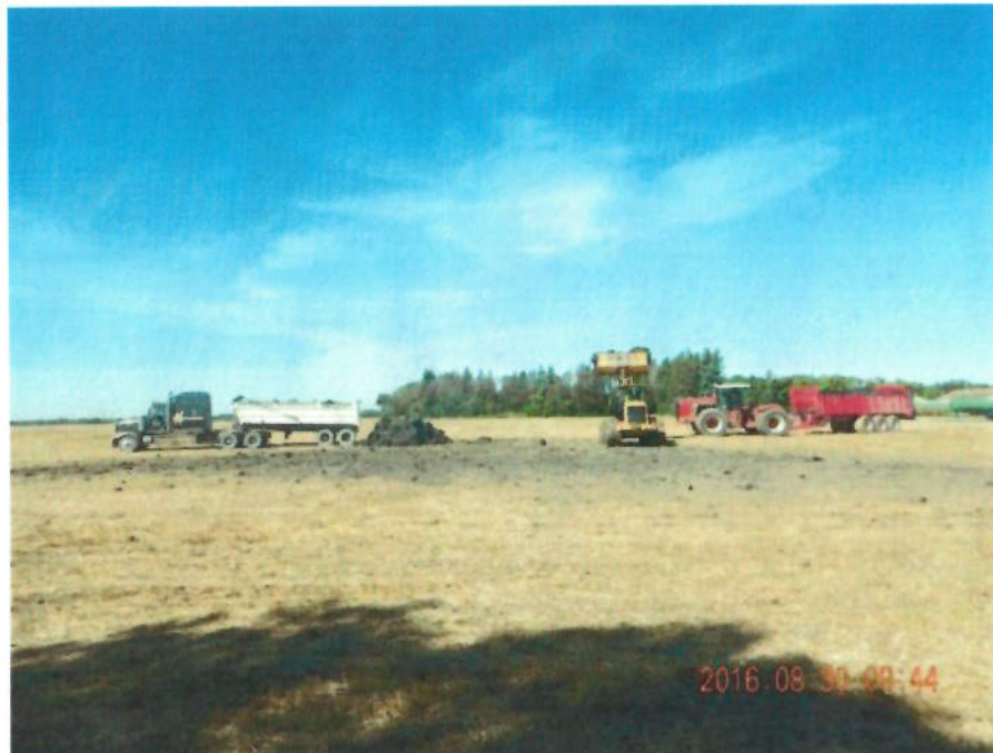
Photo 4. Staging area in NW-10-11-5EPM; unloading material from Cell #4