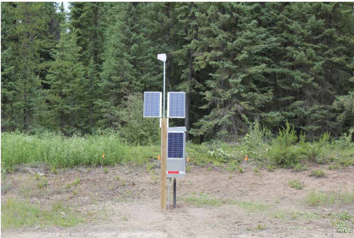
Figure 6-A Traffic monitoring station

Figure 6-A below shows a typical traffic monitoring station. Figure 6-B shows the locations of the monitoring stations.