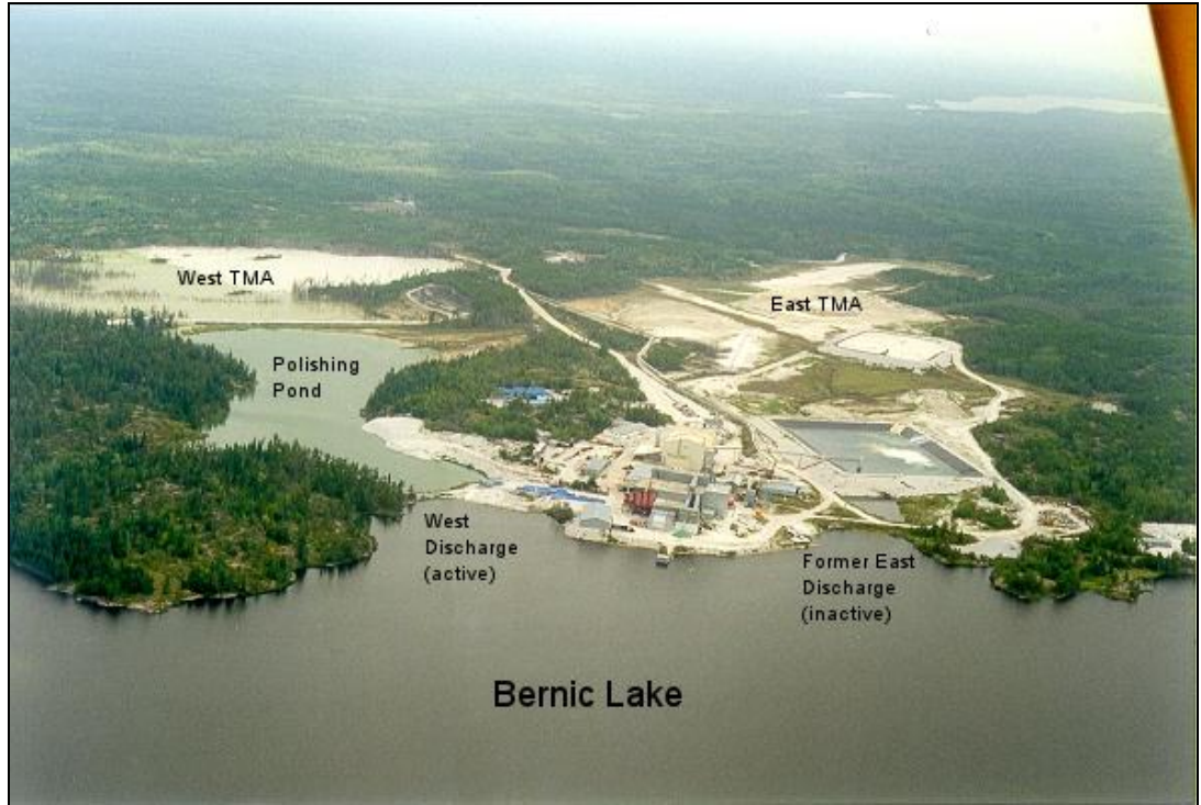
Figure 1.2 Aerial view of the TANCO mine looking north, Lac du Bonnet, MB.