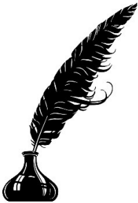
No known photo