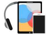
Entertainment & headset